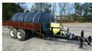
2013 AG SPRAY P288-1635 NURSE WAGON