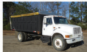
1995 INTERNATIONAL 4700 GRAIN DUMP TRUCK