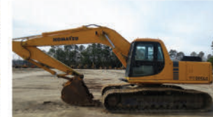
1997 KOMATSU PC200LC-6LC