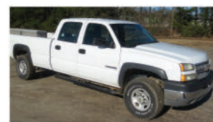
2005 CHEVROLET SILVERADO 2500HD CREW CAB 4X4