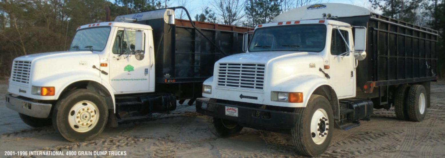
2001-1996 INTERNATIONAL 4900 GRAIN DUMP TRUCKS

SATURDAY, FEBRUARY 14, 2015 • 8:00AM • LUMBERTON, NORTH CAROLINA