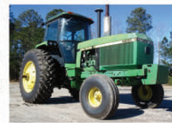
JOHN DEERE 4555 ROW-CROP