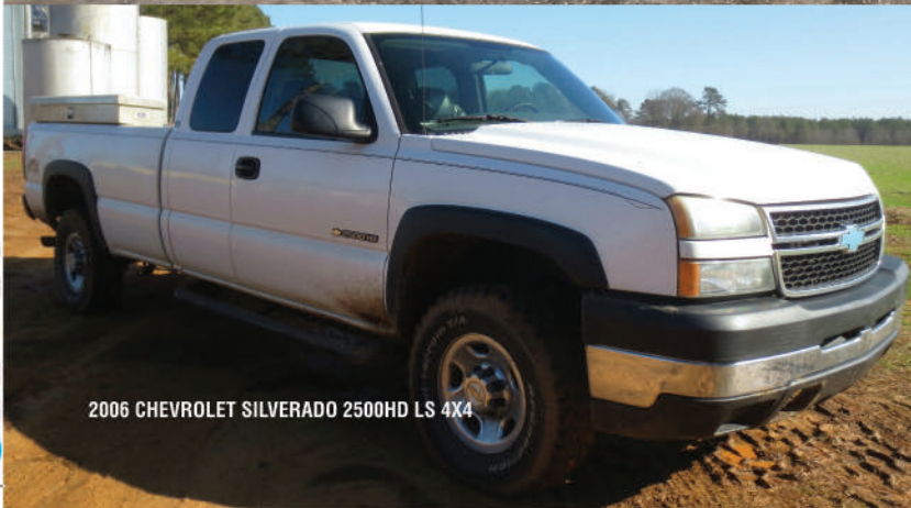
2006 CHEVROLET SILVERADO 2500HD LS 4X4