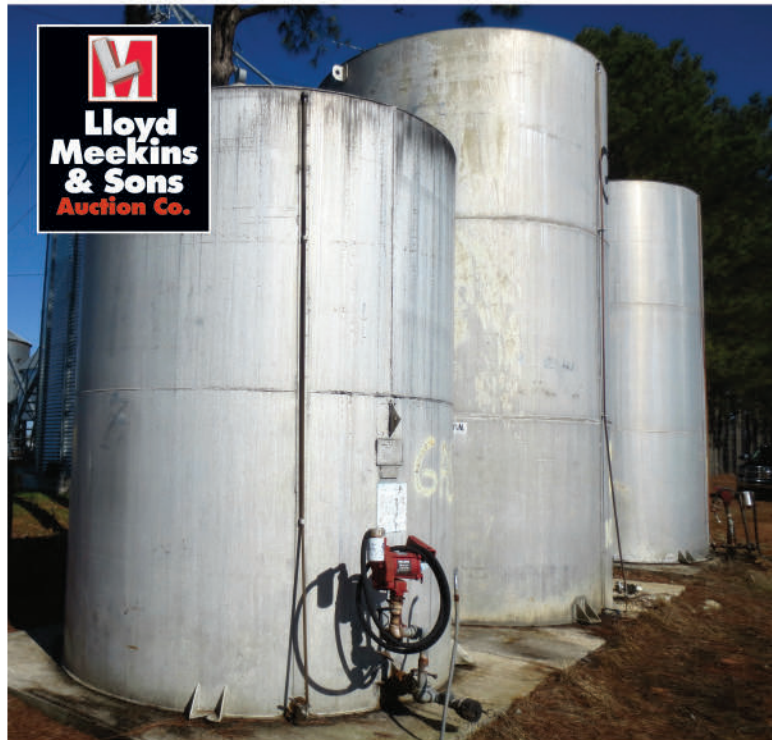
6,000 GALLON - 12,000 GALLON STORAGE TANKS