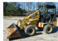
2010 WILLMAR WRANGLER 4560