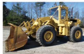
1973 CAT 966C WHEEL LOADER