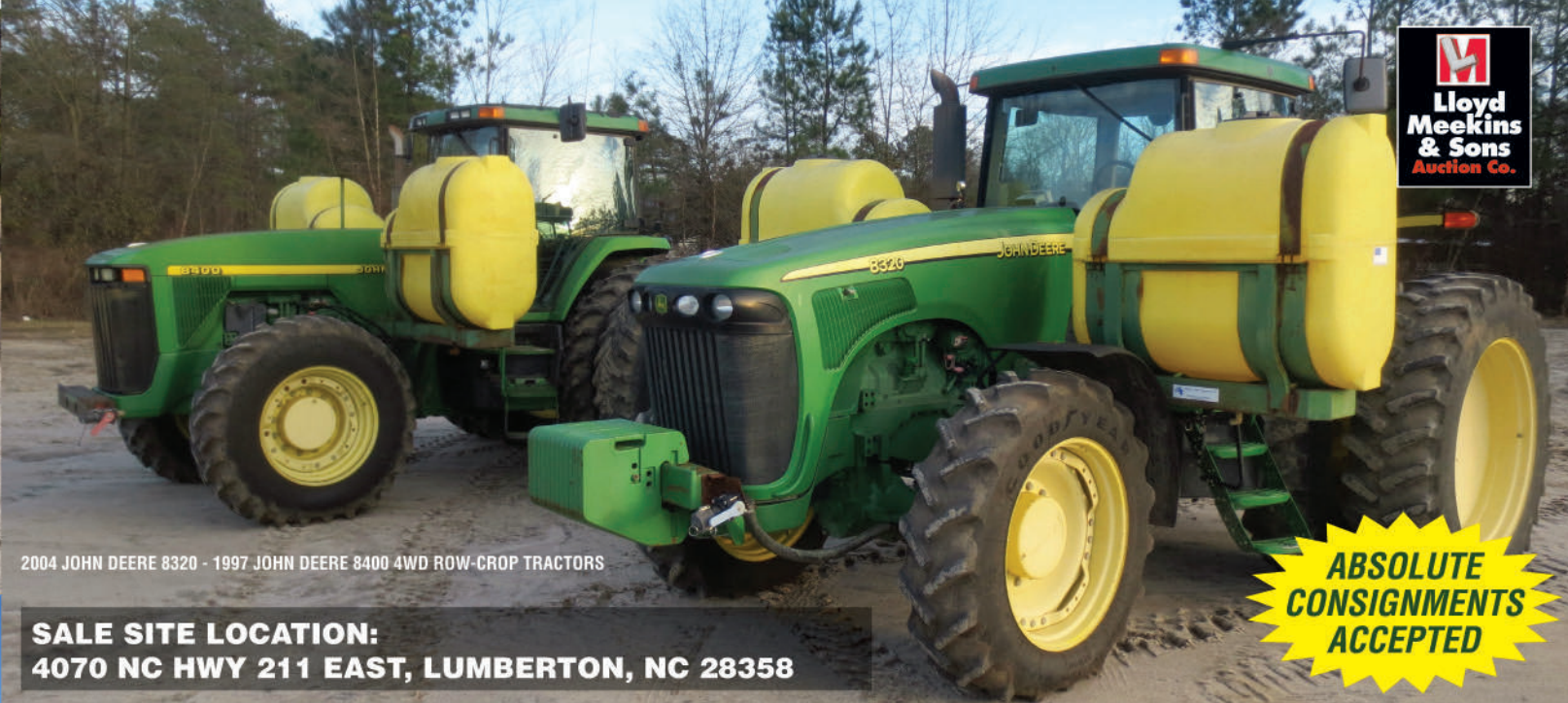
2004 JOHN DEERE 8320 - 1997 JOHN DEERE 8400 4WD ROW-CROP TRACTORS

SATURDAY, FEBRUARY 14, 2015 • 8:00AM • LUMBERTON, NORTH CAROLINA