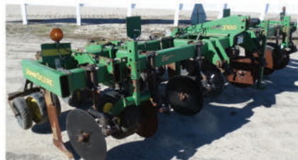
2005 JOHN DEERE 2100 MINIMUM TILL RIPPER