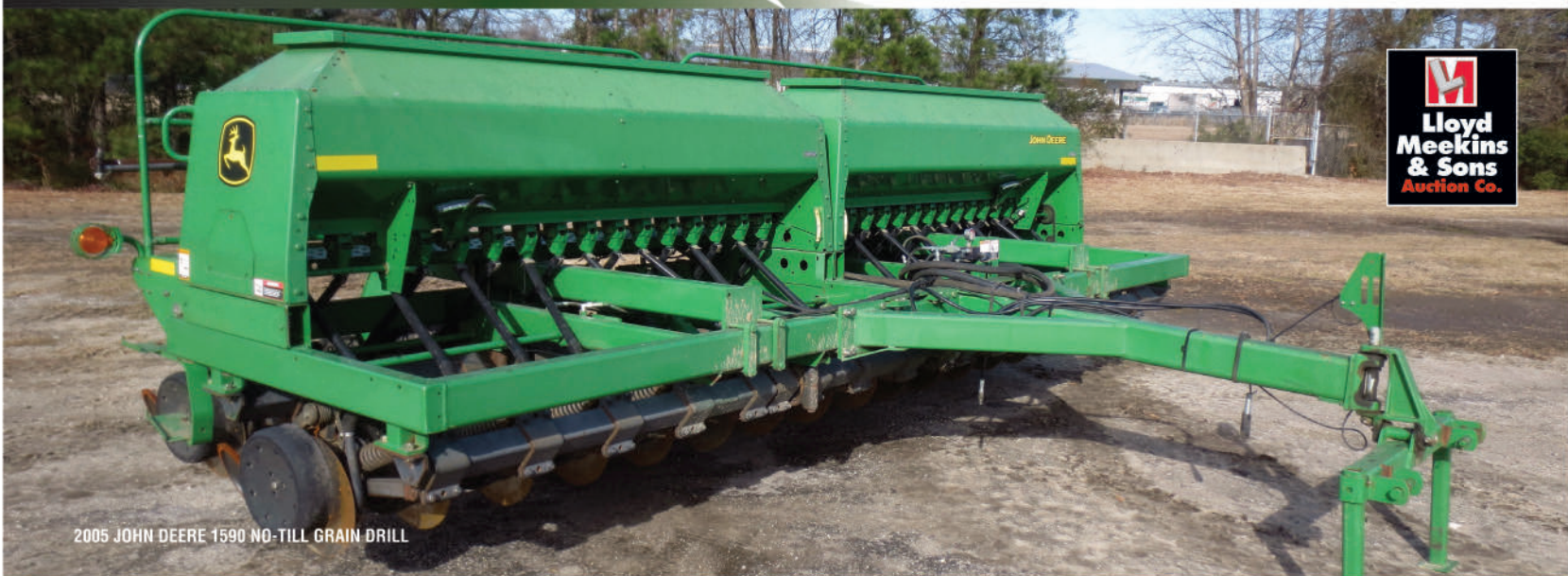
2005 JOHN DEERE 1590 NO-TILL GRAIN DRILL

SATURDAY, FEBRUARY 14, 2015 8:00 AM • LUMBERTON, NC