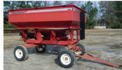
2009 UNVERFERTH 275 GRAVITY WAGON WITH AUGER-MATE 483BI