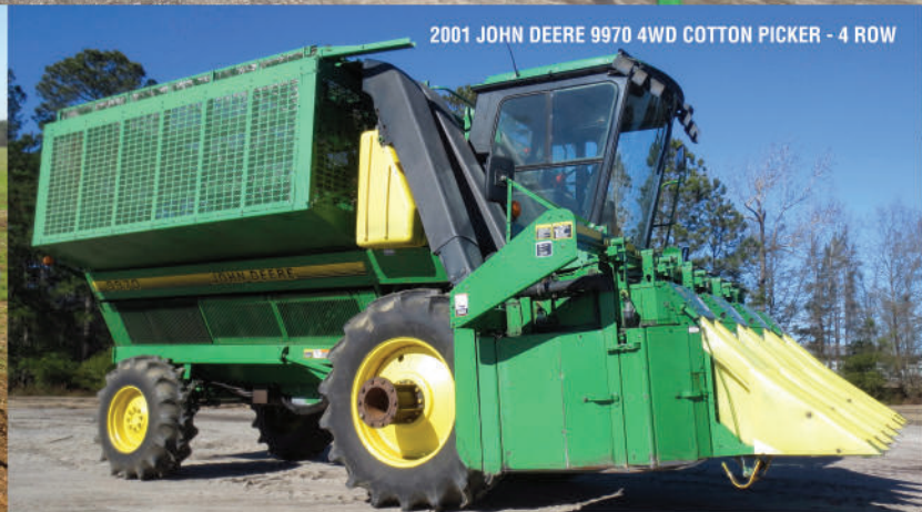
2001 JOHN DEERE 9970 4WD COTTON PICKER - 4 ROW