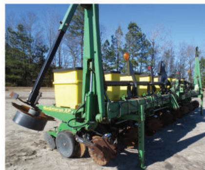
2004 JOHN DEERE 1700 MAX EMERGE XP NO-TILL PLANTER