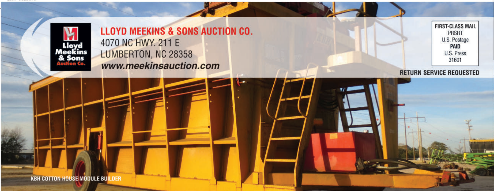
KBH COTTON HOUSE MODULE BUILDER