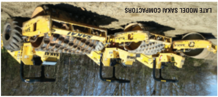
LATE MODEL SAKAI COMPACTORS