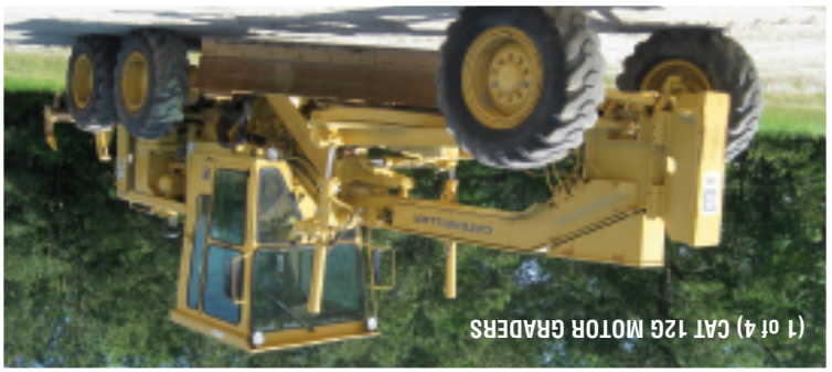
(1 of 4) CAT 12G MOTOR GRADERS

For up-to-date auction inventory, with pictures and descriptions, visit our company website meekinsauction.com www.meekinsauction.com