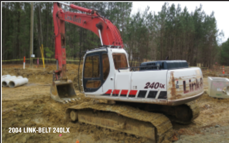
2004 LINK-BELT 240LX