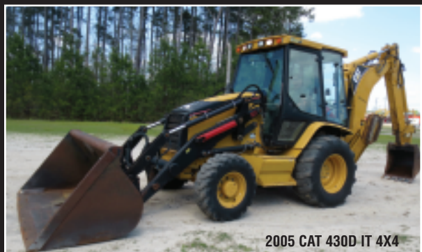
2005 CAT 430D IT 4X4