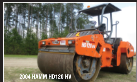
2004 HAMM HD120 HV