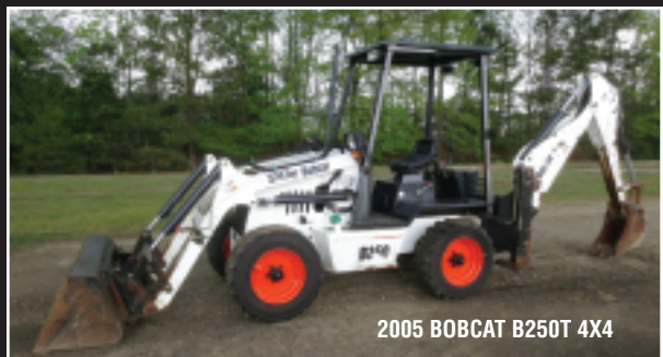
2005 BOBCAT B250T 4X4