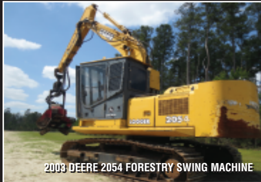
2003 DEERE 2054 FORESTRY SWING MACHINE