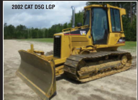
2002 CAT D5G LGP