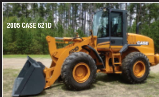
2005 CASE 621D