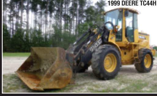
1999 DEERE TC44H