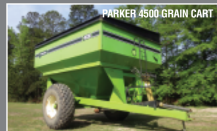
PARKER 4500 GRAIN CART