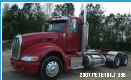
2007 PETERBILT 386