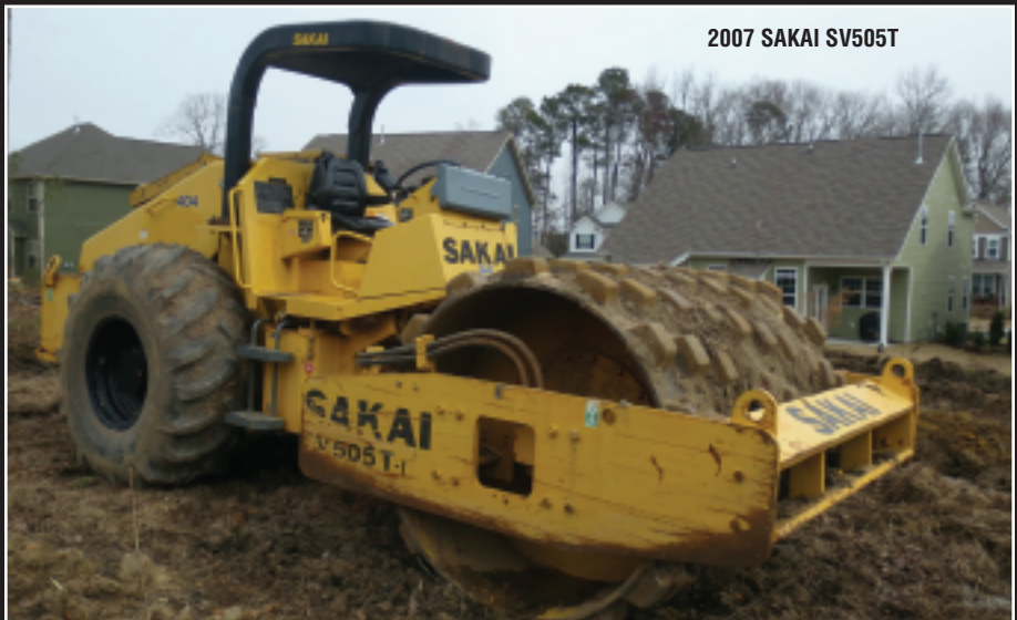
2007 SAKAI SV505T

Cat 416 , sn:5PC09253, equipped w/ Rops Canopy, Perkins engine, power shuttle transmission, 2wd, work light package, 4-n-1 loader bucket, standard stick, 30 inch hoe bucket