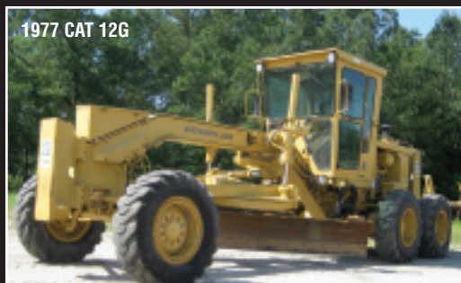
1977 CAT 12G