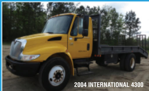
2004 INTERNATIONAL 4300