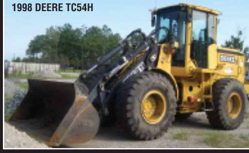
1998 DEERE TC54H