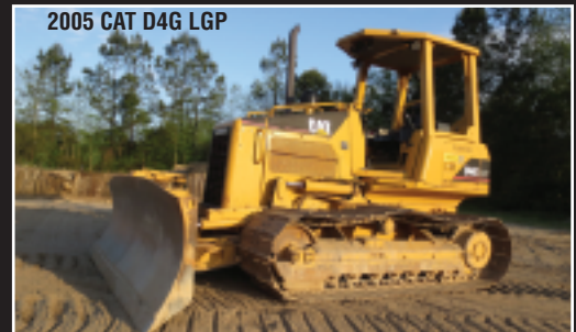
2005 CAT D4G LGP