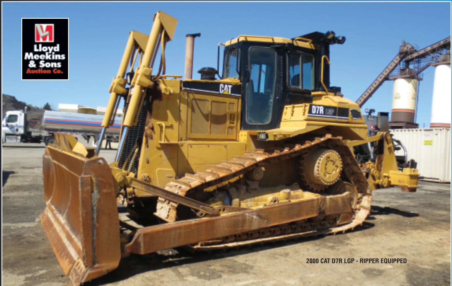
2000 CAT D7R LGP - RIPPER EQUIPPED