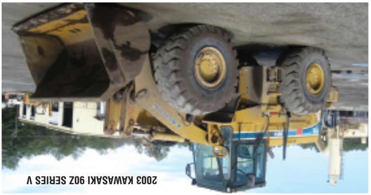
2003 KAWASAKI 90Z SERIES V