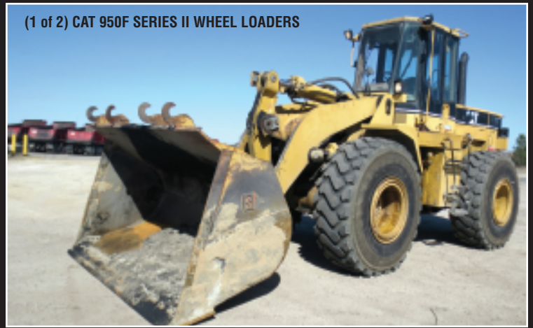
(1 of 2) CAT 950F SERIES II WHEEL LOADERS