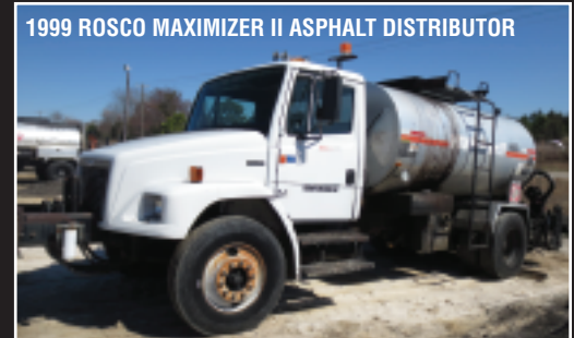
1999 ROSCO MAXIMIZER II ASPHALT DISTRIBUTOR