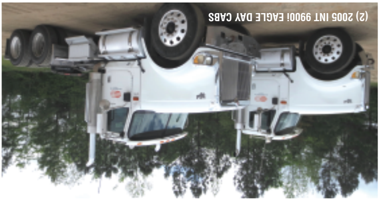
(2) 2005 INT 9900I EAGLE DAY CABS