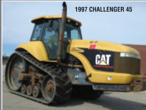
1997 CHALLENGER 45