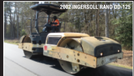
2002 INGERSOLL RAND DD-125