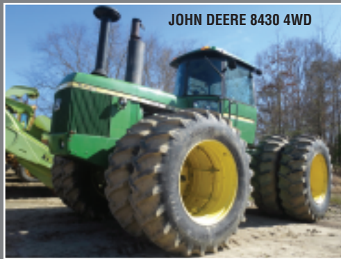
JOHN DEERE 8430 4WD