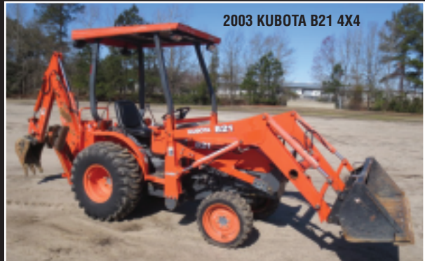
2003 KUBOTA B21 4X4