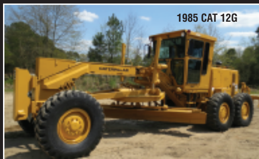
1985 CAT 12G