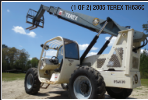
(1 OF 2) 2005 TEREX TH636C