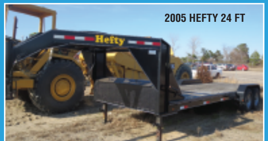
2005 HEFTY 24 FT