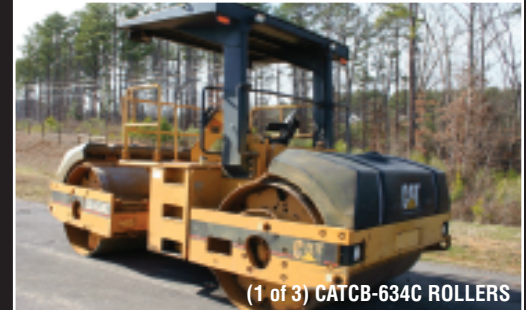
(1 of 3) CATCB-634C ROLLERS