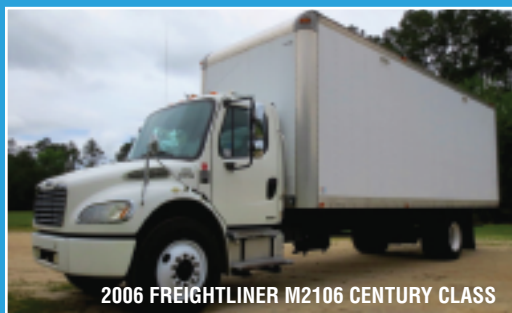
2006 FREIGHTLINER M2106 CENTURY CLASS