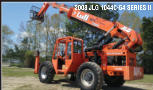
2008 JLG 1044C-54 SERIES II