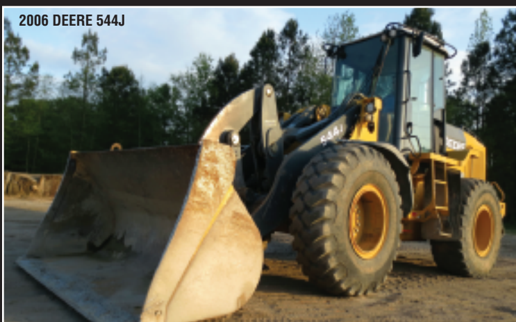
2006 DEERE 544J