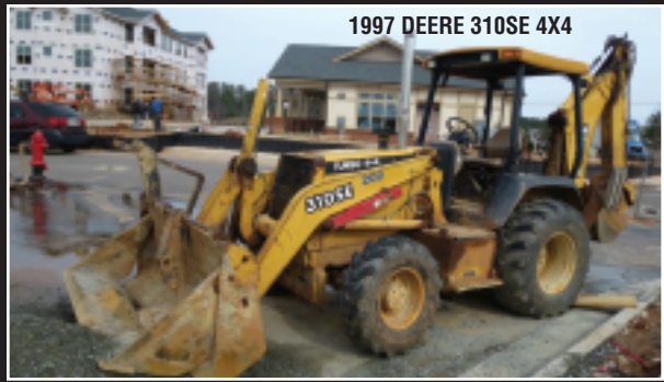
1997 DEERE 310SE 4X4