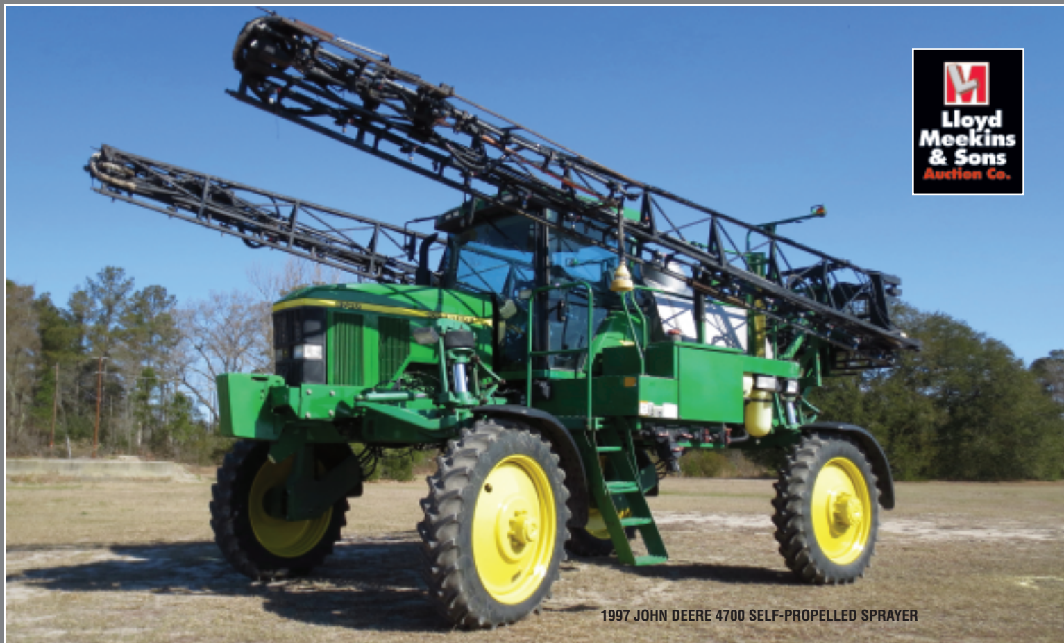
1997 JOHN DEERE 4700 SELF-PROPELLED SPRAYER