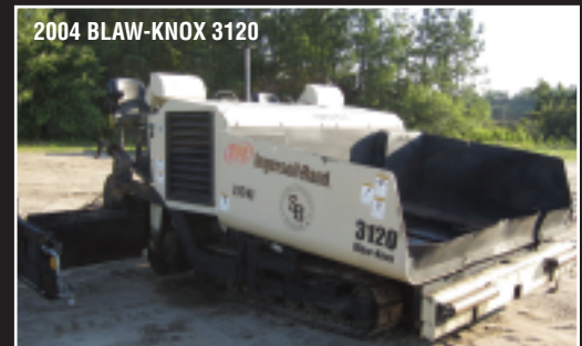
2004 BLAW-KNOX 3120