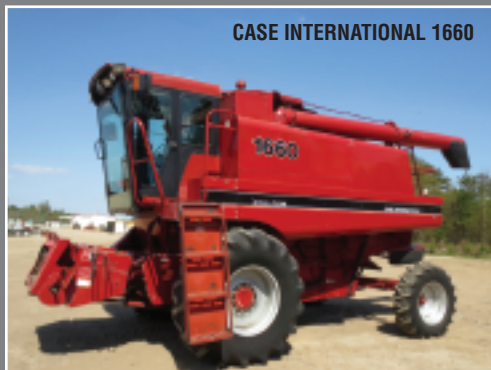
CASE INTERNATIONAL 1660