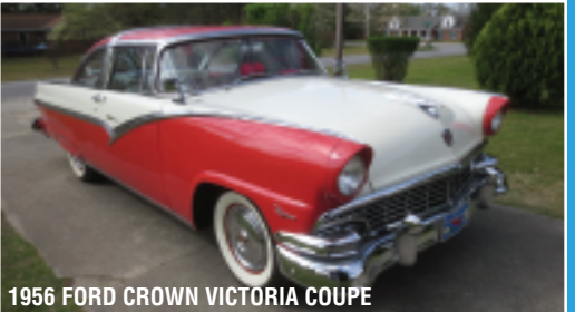
1956 FORD CROWN VICTORIA COUPE