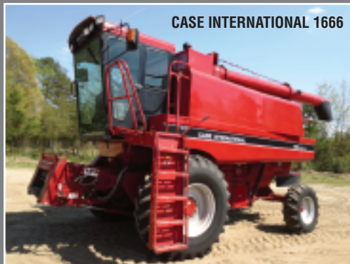
CASE INTERNATIONAL 1666