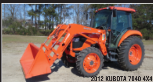
2012 KUBOTA 7040 4X4

2006 Gehl 6640E , sn:GHL06640K00606357, equipped w/ Rops Canopy, Deutz turbo engine, auxiliary hydraulics, 12-16.5 tires, 1,817 hrs 2000 Gehl 6635SXT , sn:12201, equipped w/ Rops Canopy, Deutz turbo engine, work light package, auxiliary hydraulics, 4-n-1 loader bucket 2002 Toro Dingo TX-425 Mini , sn:220000521, equipped w/ Kohler 25HP engine, hydrostatic track drive, wide track series, walk behind operation, rubber tracks, aux hydraulics, quick attach loader bucket, meter reading: 141 hrs 2005 Toro Dingo TX-420 Mini , sn:250000158, equipped w/ Kohler 20HP engine, hydrostatic track drive, walk behind operation, rubber tracks, aux hydraulics, quick attach loader bucket, meter reading: 172 hrs