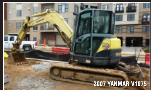
2007 YANMAR V1075