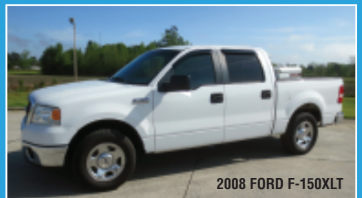
2008 FORD F-150XL