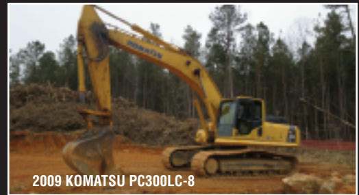
2009 KOMATSU PC300LC-8