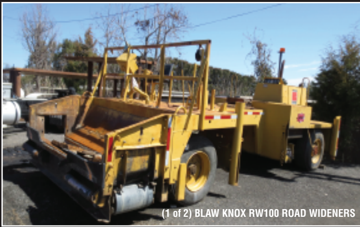
(1 of 2) BLAW KNOX RW100 ROAD WIDENERS