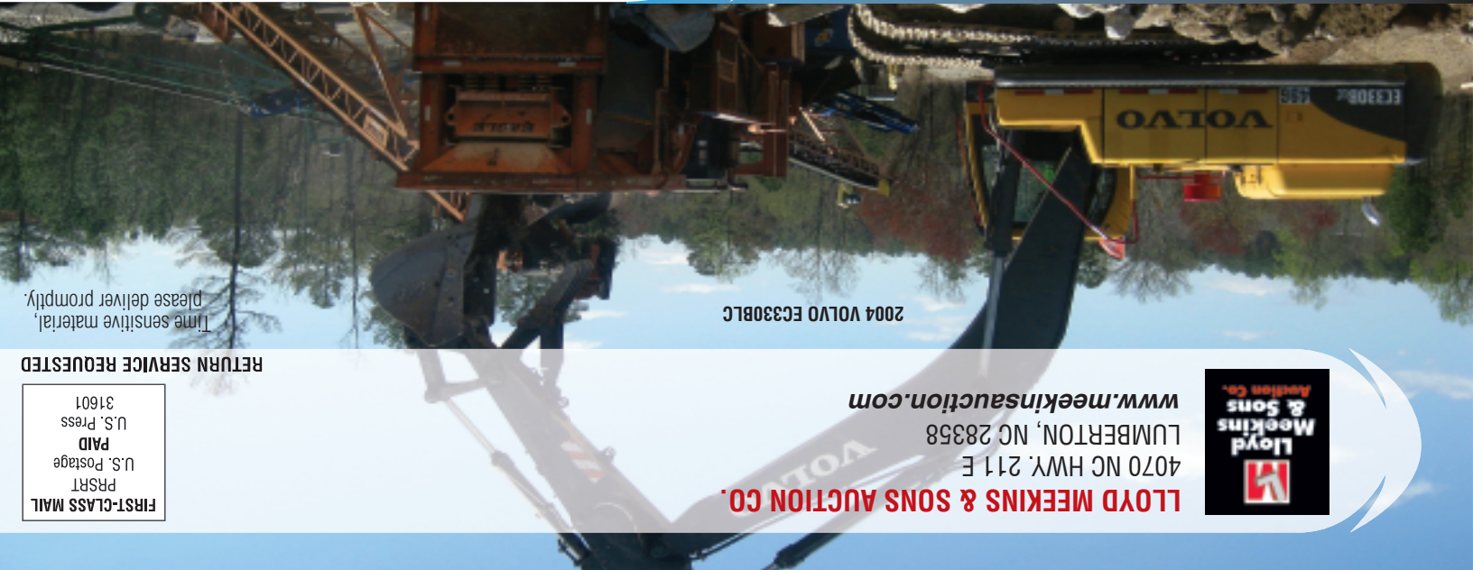
2004 VOLVO EC330BLC

Time sensitive material, please deliver promptly.