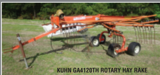
KUHN GA4120TH ROTARY HAY RAKE