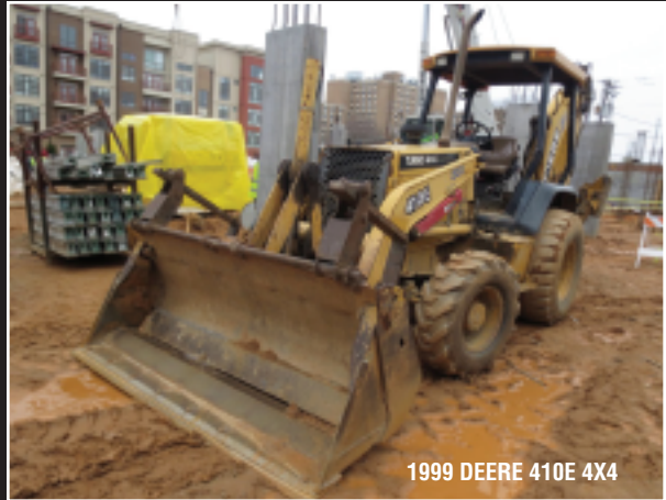
1999 DEERE 410E 4X4