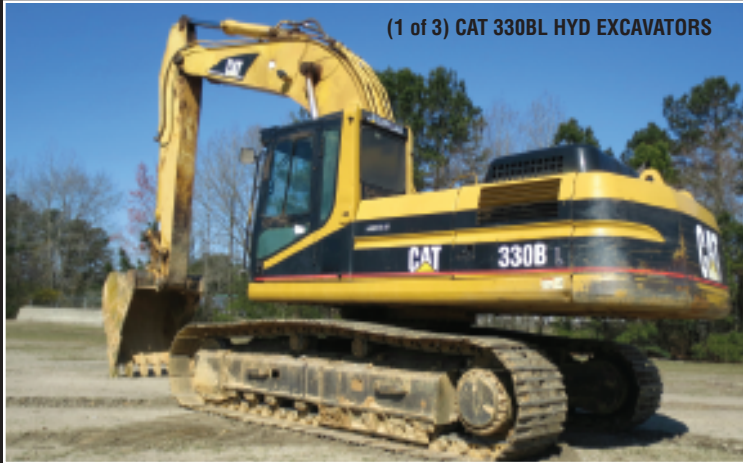
(1 of 3) CAT 330BL HYD EXCAVATORS