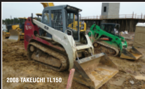
2008 TAKEUCHI TL150