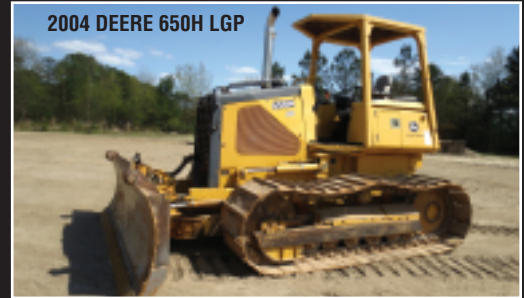
2004 DEERE 650H LGP