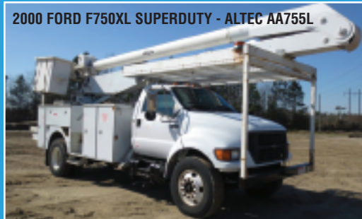
2000 FORD F750XL SUPERDUTY - ALTEC AA755L