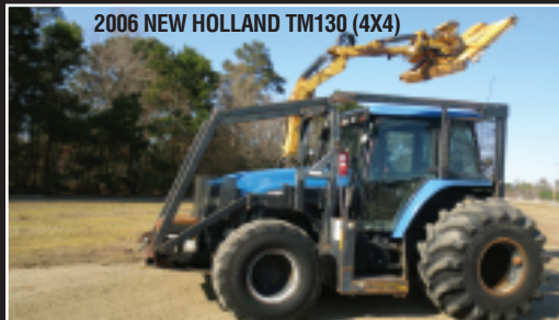
2006 NEW HOLLAND TM130 (4X4)