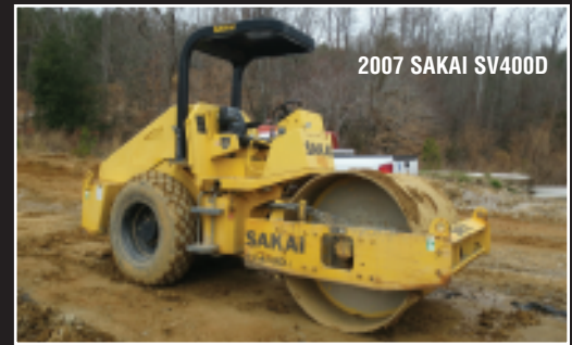
2007 SAKAI SV400D

1998 Bomag BW142D , sn:109510120414, equipped w/ Rops Canopy, Deutz engine, hydrostatic transmission, 56 inch drum, 14.9-24 tires, 1,201 hrs