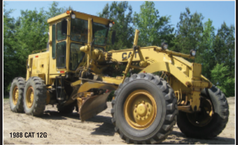
1988 CAT 12G