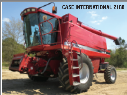
CASE INTERNATIONAL 2188