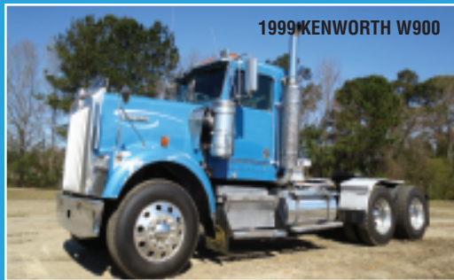
1999 KENWORTH W900