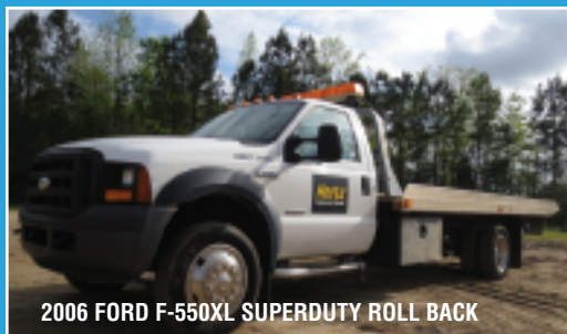
2006 FORD F-550XL SUPERDUTY ROLL BACK