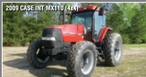
2009 CASE INT MX110 (4x4)