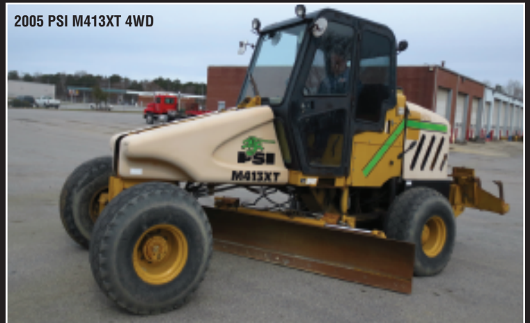
2005 PSI M413XT 4WD