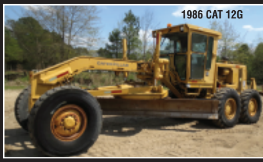
1986 CAT 12G