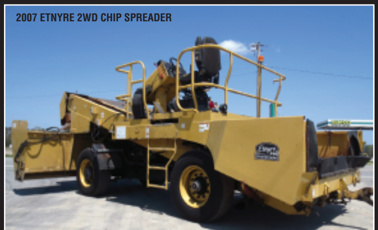
2007 ETNYRE 2WD CHIP SPREADER