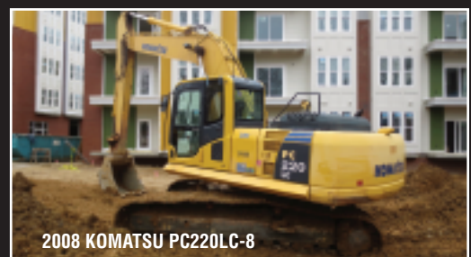
2008 KOMATSU PC220LC-8