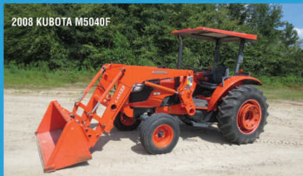
2008 KUBOTA M5040F