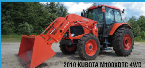
2010 KUBOTA M100XDTC 4WD