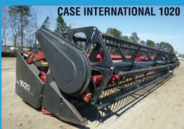
CASE INTERNATIONAL 1020