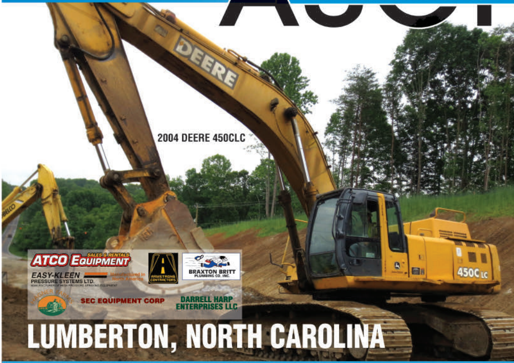
2004 DEERE 450CLC