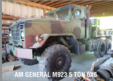
AM GENERAL M923 5 TON 6X6