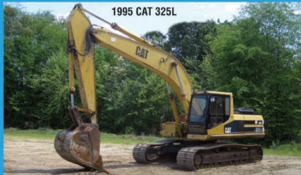
1995 CAT 325L