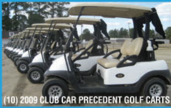
(10) 2009 CLUB CAR PRECEDENT GOLF CARTS