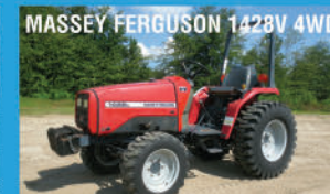
MASSEY FERGUSON 1428V 4WD