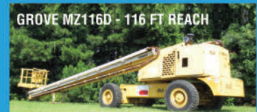
GROVE MZ116D - 116 FT REACH