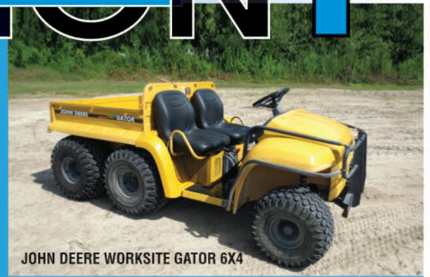
JOHN DEERE WORKSITE GATOR 6X4