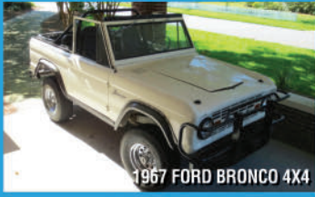
1967 FORD BRONCO 4X4