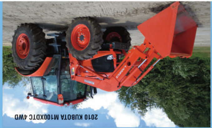
2010 KUBOTA M100XDTC 4WD