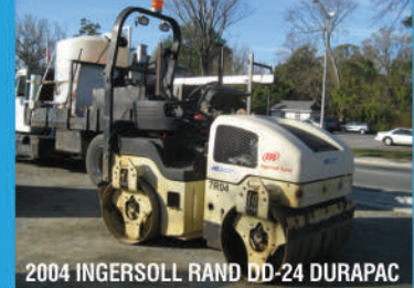
2004 INGERSOLL RAND DD-24 DURAPAC