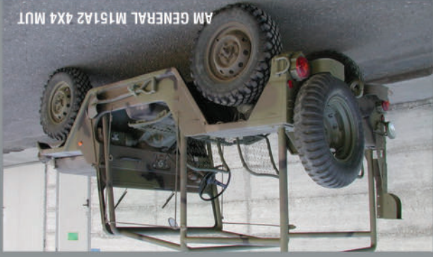
AM GENERAL M151A2 4X4 MUT