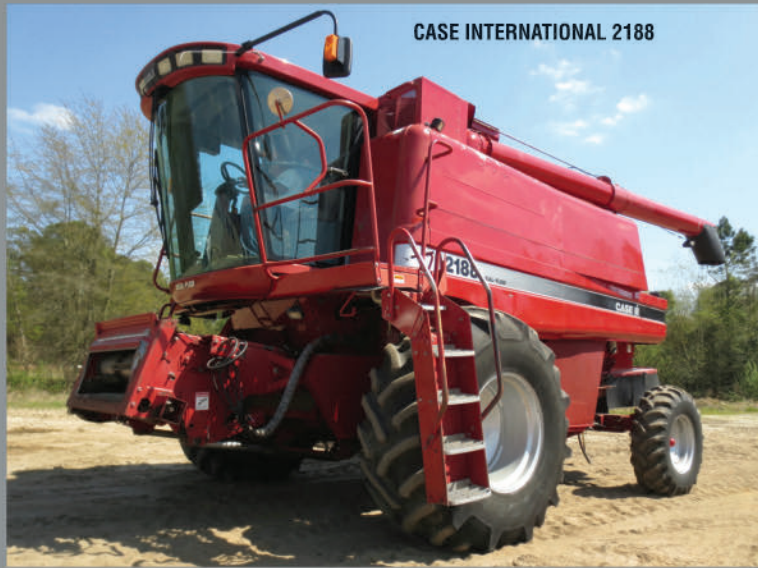
CASE INTERNATIONAL 2188