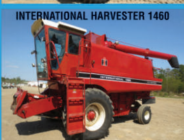
INTERNATIONAL HARVESTER 1460