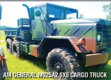
AM GENERAL M925A2 6X6 CARGO TRUCK