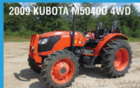
2009 KUBOTA M5040D 4WD