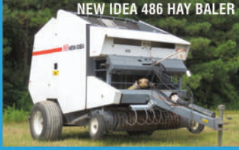
NEW IDEA 486 HAY BALER