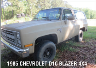
1985 CHEVROLET D10 BLAZER 4X4