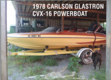
1978 CARLSON GLASTRON CVX-16 POWERBOAT