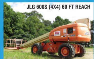
JLG 600S (4X4) 60 FT REACH