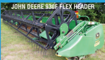
JOHN DEERE 930F FLEX HEADER

2002 John Deere 9650STS (4WD) Combine , sn:H09650S696686, equipped w/ A/C Cab, 6 cyl (290HP) turbo engine, hydrostatic transmission, work light package, John Deere Greenstar AMS-Precision farming system cab controls, 250 bushel grain tank capability, 18.4 R 42 front dual tires, 18.4 R 26 rear tires, 3,383 engine hrs, 2,209 separator hrs