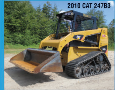
2010 CAT 247B3