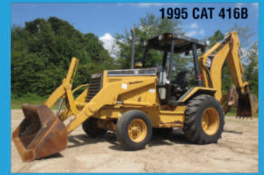
1995 CAT 416B