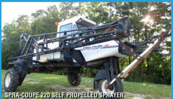
SPRA-COUBE 220 SELF PROPELLED SPRAYER