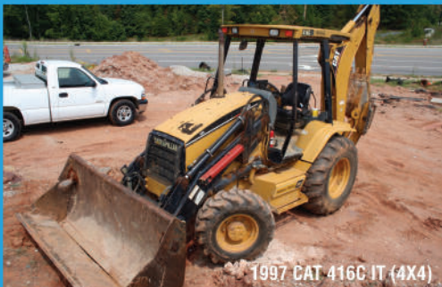
1997 CAT 416C IT (4X4)