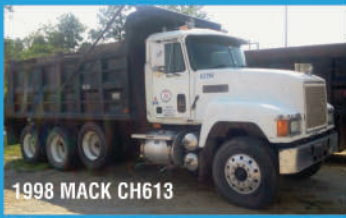
1998 MACK CH613