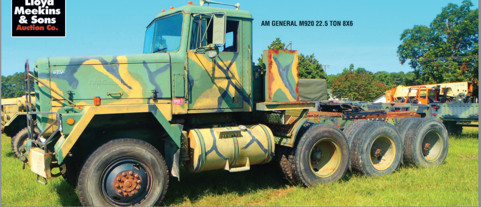
AM GENERAL M920 22.5 TON 8X6

AUCTION TO FEATURE: CONSTRUCTION EQUIPMENT, AGRICULTURAL EQUIPMENT, TRUCKS AND TRAILERS, ATTACHMENTS, LARGE SELECTION OF MILITARY TRUCKS AND EQUIPMENT, SUPPORT EQUIPMENT, SHOP TOOLS AND ACCESSORIES, EQUIPMENT & TRUCK PARTS, PICKUPS, SPORT UTILITY VEHICLES, ATVs, BOATS, AND MUCH MORE. MAKE PLANS TODAY TO ATTEND!