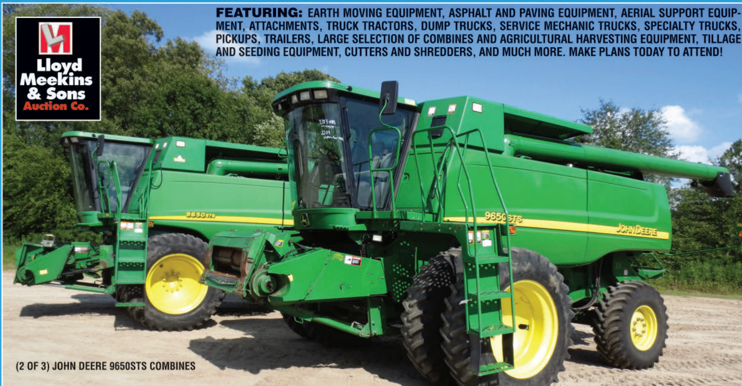
(2 OF 3) JOHN DEERE 9650STS COMBINES

FEATURING: EARTH MOVING EQUIPMENT, ASPHALT AND PAVING EQUIPMENT, AERIAL SUPPORT EQUIPMENT, ATTACHMENTS, TRUCK TRACTORS, DUMP TRUCKS, SERVICE MECHANIC TRUCKS, SPECIALTY TRUCKS, PICKUPS, TRAILERS, LARGE SELECTION OF COMBINES AND AGRICULTURAL HARVESTING EQUIPMENT, TILLAGE AND SEEDING EQUIPMENT, CUTTERS AND SHREDDERS, AND MUCH MORE. MAKE PLANS TODAY TO ATTEND!