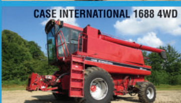
CASE INTERNATIONAL 1688 4WD