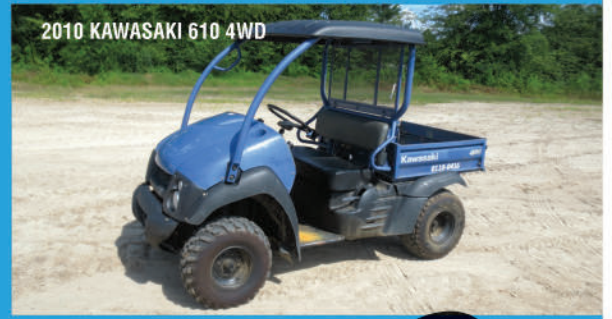
2010 KAWASAKI 610 4WD