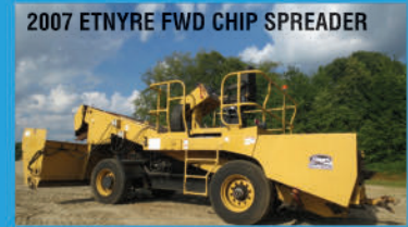
2007 ETNYRE FWD CHIP SPREADER