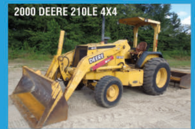
2000 DEERE 210LE 4X4