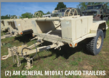
(2) AM GENERAL M101A1 CARGO TRAILERS