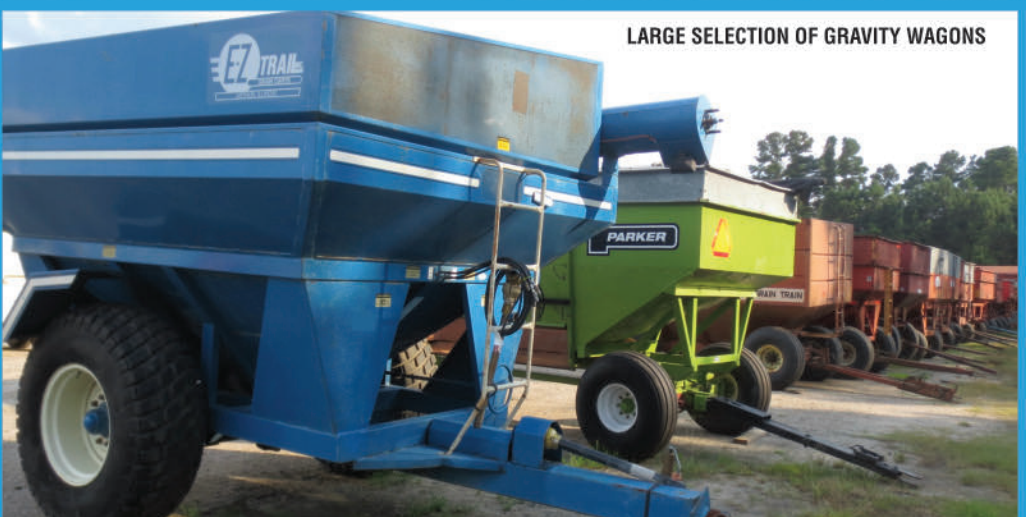
LARGE SELECTION OF GRAVITY WAGONS

Layout 1 (Page 4) Created: 7/25/13 12:10 PM BY: Quarckxpress(R) 8.5 2400.0 dpi (Screened Data File POS, Right-Reading, Color-Seqs, Enh-OVP Simulated Spot Colors) [ TRAP ABO:100 Scaling Enh-OVP Simulated Spot Colors ] bleed: 0.125 margin size: 0.375 Cyan Magenta Yellow Black PS Version: 3015.102 High Version 7.0 Revision 91 PSI System 10.6 Build: #21, Ripped on Thursday, July 25, 2013 12:10:4 ID: ROSENATV