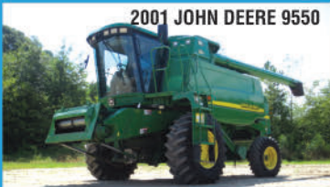
2001 JOHN DEERE 9550