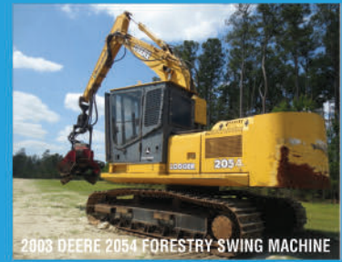
2003 DEERE 2054 FORESTRY SWING MACHINE

equipped w/ A/C Cab, 6 cyl (290HP) turbo engine, hydrostatic transmission, work light package, John Deere Greenstar AMS-Precision farming system cab controls, 250 bushel grain tank capability, 520/85R 38 front dual tires, 18.4 R 26 rear tires, 1,951 engine hrs, 1,200 separator hrs