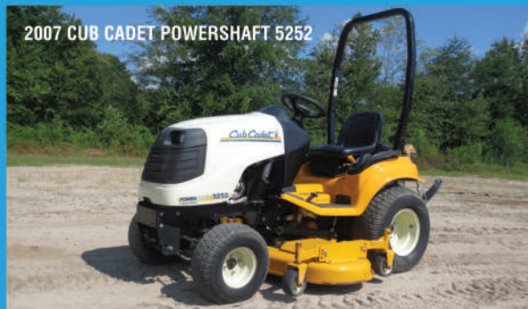
2007 CUB CADET POWERSHAFT 5252