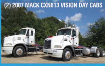
(2) 2007 MACK CXN613 VISION DAY CABS