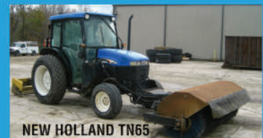
NEW HOLLAND TN65