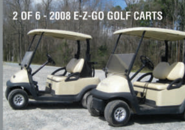
2 OF 6 - 2008 E-Z-GO GOLF CARTS