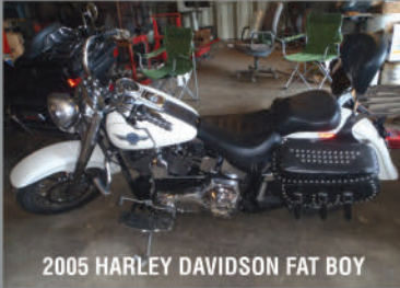
2005 HARLEY DAVIDSON FAT BOY