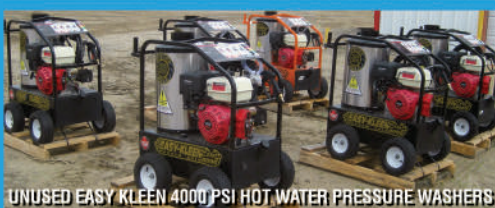
UNUSED EASY KLEEN 4000 PSI HOT WATER PRESSURE WASHERS