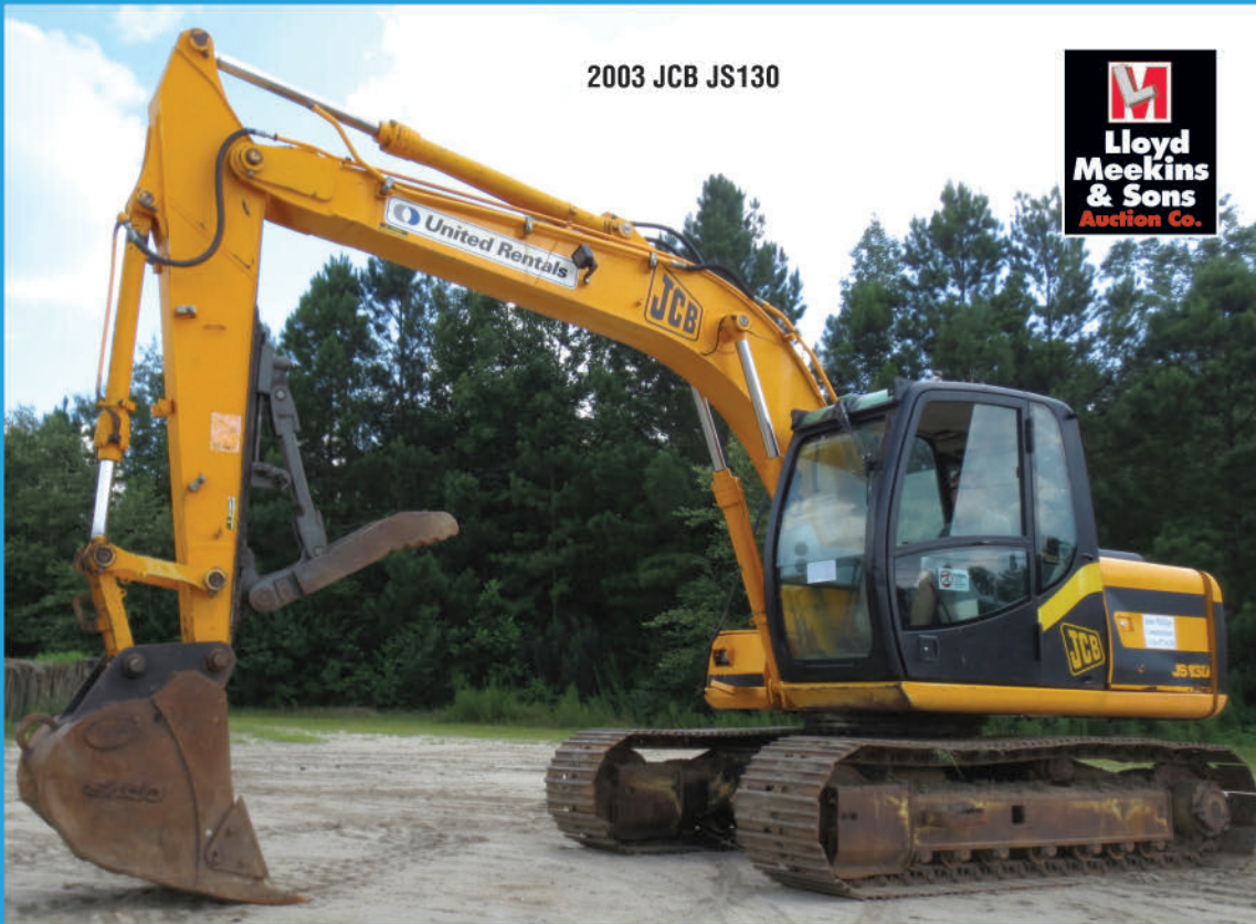
2003 JCB JS130