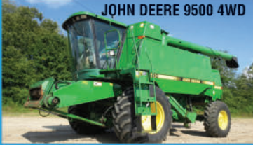
JOHN DEERE 9500 4WD