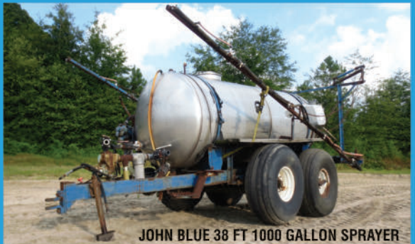
JOHN BLUE 38 FT 1000 GALLON SPRAYER