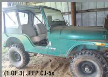
(1 OF 3) JEEP CJ-5s