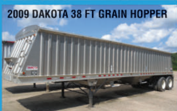
2009 DAKOTA 38 FT GRAIN HOPPER