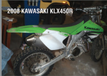
2008 KAWASAKI KLX450R