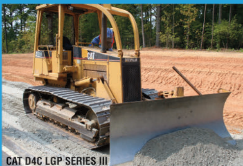
CAT D4C LGP SERIES III