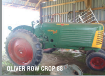
OLIVER ROW CROP 88

Descriptions at our company website: www.meekinsauction.com