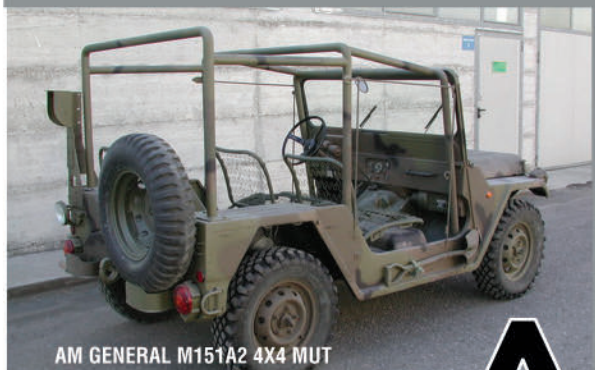
AM GENERAL M151A2 4X4 MUT