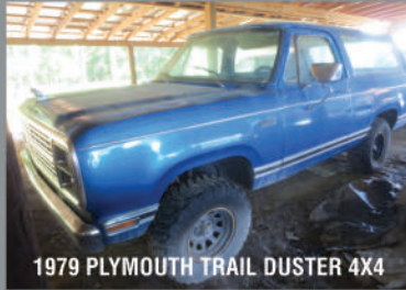
1979 PLYMOUTH TRAIL DUSTER 4X4