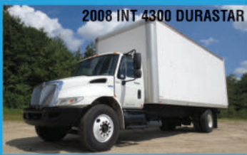
2008 INT 4300 DURASTAR