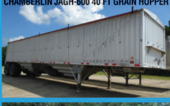
CHAMBERLIN JAGH-600 40 FT GRAIN HOPPER