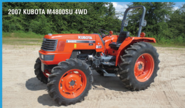
2007 KUBOTA M4800SU 4WD