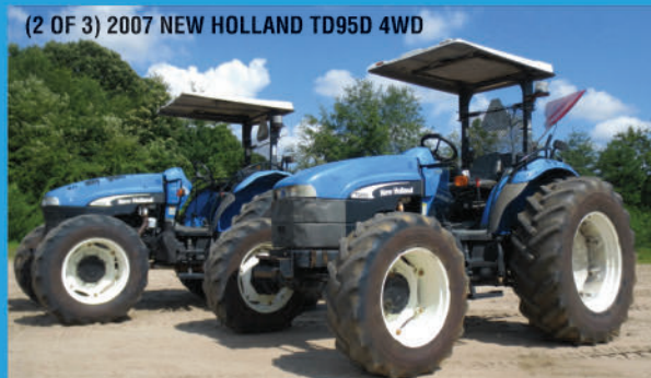
(2 OF 3) 2007 NEW HOLLAND TD95D 4WD