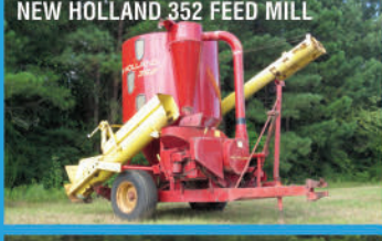
NEW HOLLAND 352 FEED MILL