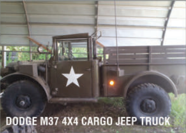
DODGE M37 4X4 CARGO JEEP TRUCK