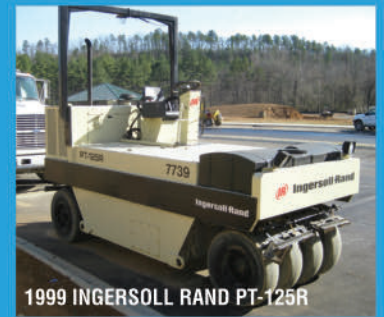
1999 INGERSOLL RAND PT-125R