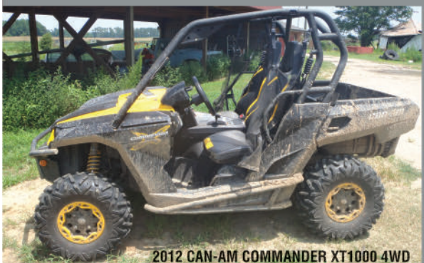
2012 CAN-AM COMMANDER XT1000 4WD

AUCTION 1 ..... PG 2-8 AUCTION 2 ..... PG 9-11