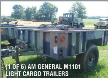
(1 OF 6) AM GENERAL M1101 LIGHT CARGO TRAILERS