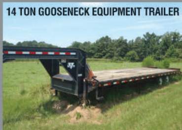
14 TON GOOSENECK EQUIPMENT TRAILER