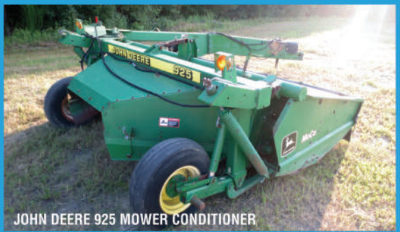
JOHN DEERE 925 MOWER CONDITIONER