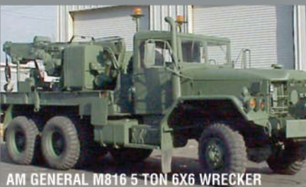
AM GENERAL M816 5 TON 6X6 WRECKER