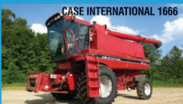
CASE INTERNATIONAL 1666