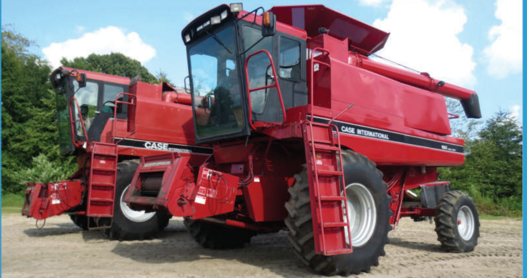
(2 OF 3) CASE INT 1660 AXIAL-FLOW COMBINES