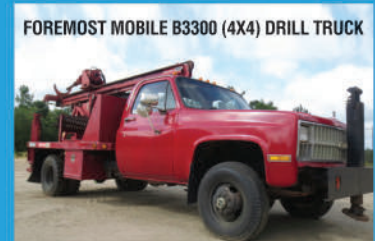
FOREMOST MOBILE B3300 (4X4) DRILL TRUCK