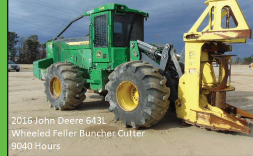
2016 John Deere 643L Wheeled Feller Buncher Cutter 9040 Hours